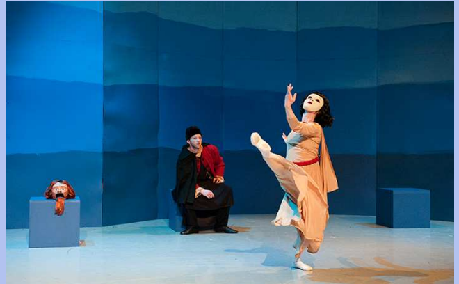
Performance of The King of the Great Clock Tower