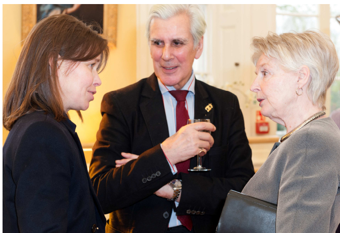
The Royal Ballet School Vice President, The Lady Sarah Chatto (left) meets Donald MacLeary and Dame Antoinette Sibley

On 17 January a private view was held for Lady Sainsbury with her family and friends. We were delighted to be joined by her husband John, Lord Sainsbury of Preston Candover. Together they formed the Linbury Trust in 1973, which has extensively supported organisations within the arts, education and social welfare. It was a great pleasure to welcome back The Royal Ballet School's Vice President, The Lady Sarah Chatto, who officially opened White Lodge Museum in 2009.