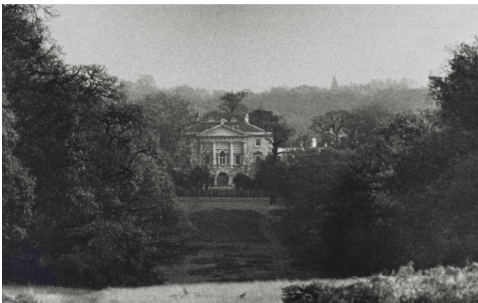
Arcadian White Lodge.