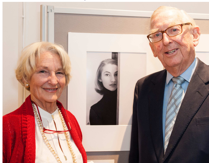
Lord and Lady Sainsbury with a captivating portrait of Anya Linden by Antony Armstrong-Jones c. 1959, when she was a Principal of The Royal Ballet