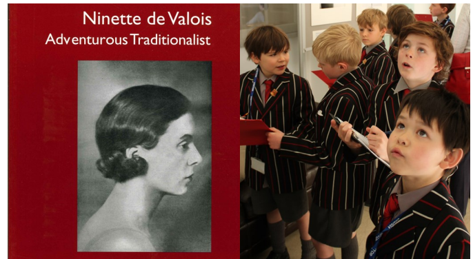
L: Ninette de Valois: Adventurous Traditionalist conference publication, Dance Books (2012) R: A recent school visit to White Lodge Museum

Key exhibitions from the past five years include The Rake's Progress , which explored Ninette de Valois' ballet, inspired by the famous paintings by Hogarth. Most recently Rudolf Nureyev: in search of perfection proved to be one of our most popular exhibits, featuring costumes from Nureyev's personal collection, generously loaned by a private collector.