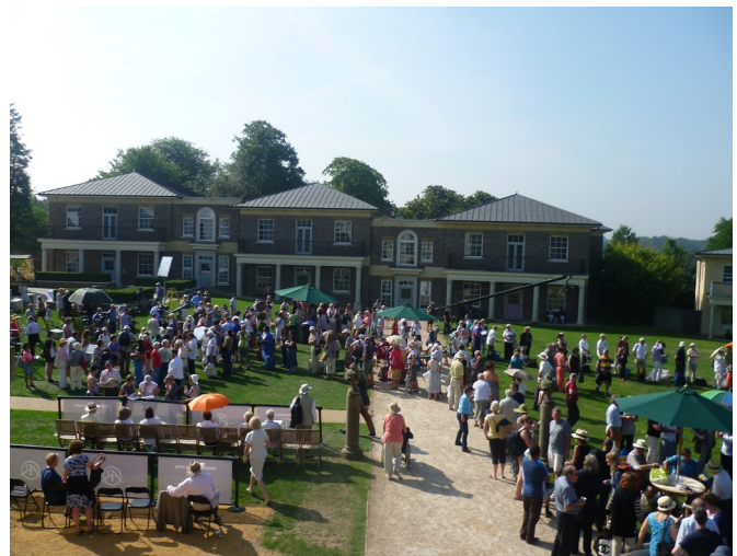
Keen crowds arrive with their objects for valuation

Two programmes were created from the footage, the first aired in January, following which we received a surge in visitors and donations of artefacts. We eagerly await the second episode, which we expect to be broadcast in June. This was a unique experience which we were proud to be a part of.