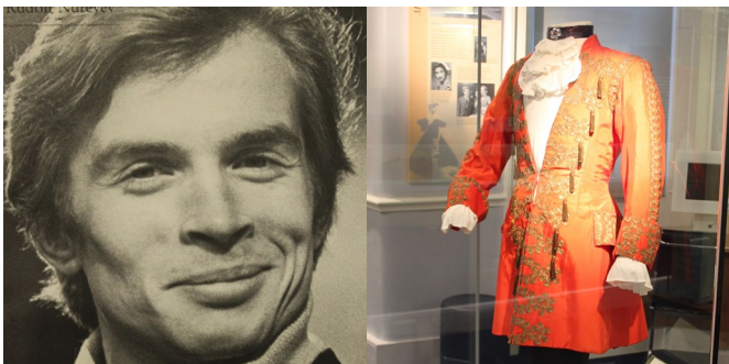
L: Poster of Rudolf Nureyev featuring photography by Anthony Crickmay R: Costume worn by David Bintley in the title role of Ninette de Valois' ballet The Rake's Progress

The museum was created as part of an extensive redevelopment of the White Lodge site, which began in 2004. Government funding for the project was granted with the proviso that the School provide greater public access to the historically significant building. White Lodge Museum became the means by which visitors could enter White Lodge and learn about its historic and current occupants, whilst activities of the working School continued as normal.