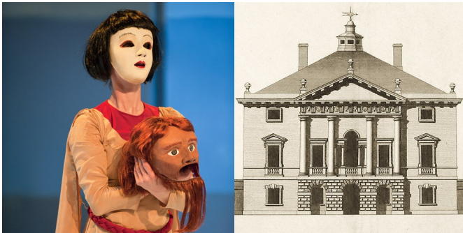
L: The King of the Great Clock Tower performance at the Ninette de Valois Conference. R: White Lodge elevation from Vitruvius Britannicus

February 2014 marked five years since White Lodge Museum first opened to the public. We have welcomed over 11,000 visitors to Georgian White Lodge, engaging them with the history of British ballet and introducing them to the work of The Royal Ballet School.