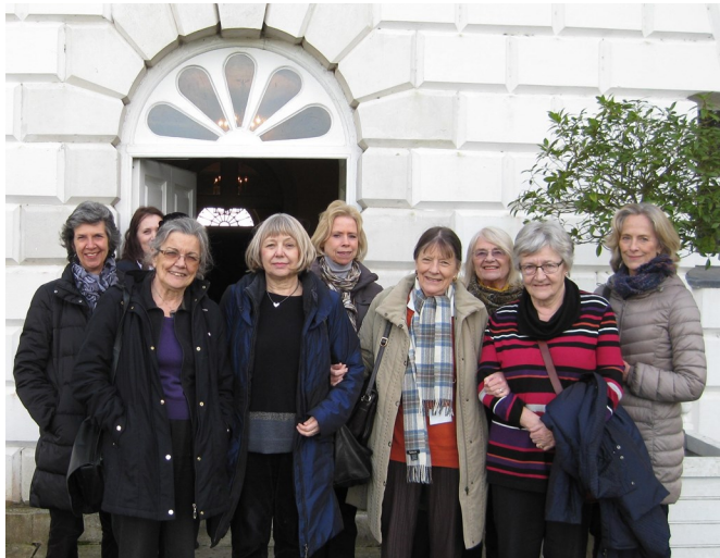
The White Lodge Museum Volunteer Team outside Marble Hill House following the guided tour