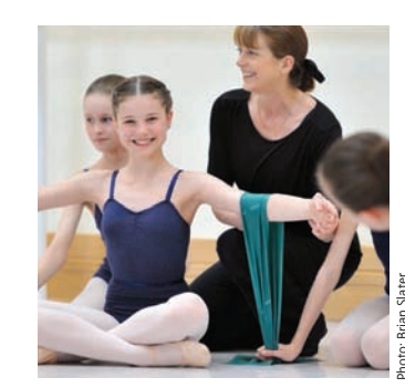
A Mid Associate girls class