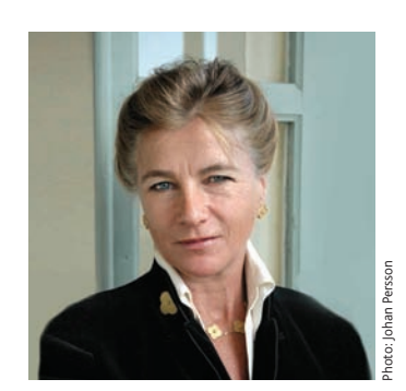
The Marchioness of Douro OBE