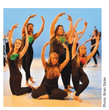
Participants in the aDvANCE National event

The Museum continued local partnerships with Orleans House Gallery, artsrichmond and The Lovekyn Consort (based at Hampton Court Palace) to coordinate activities around the Richmond Gardens Festival (May-October 2013). Museum visits were combined with summer evening music concerts in the Salon, guided walks and local artists' sketching days. The Museum will continue to develop these highly popular formats.