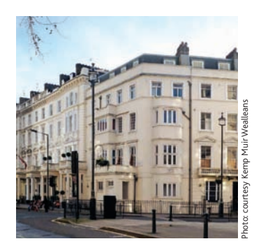
Artist's impression of the finished student accommodation in Pimlico