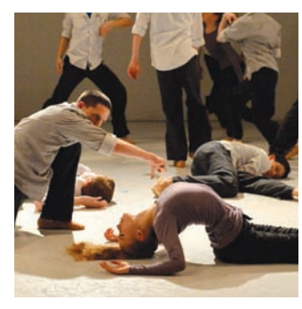
Collaborative aDvANCE performance with Impact Dance

CHILDREN IN 27 PRIMARY SCHOOLS EXPERIENCED A CREATIVE INTRODUCTION TO BALLET