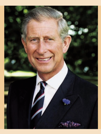
HRH The Prince of Wales, President